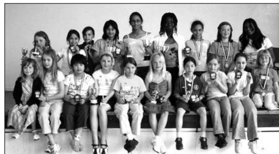
Some of the prize winners

The full results and details of all forthcoming events are available on the chess for women and girls website "chessuk.com".