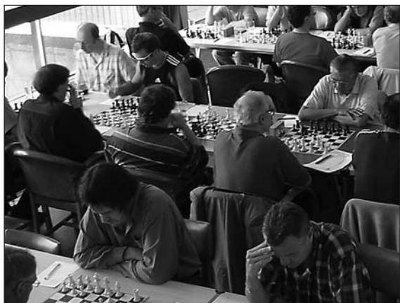
Left: General view of playing hall, each row of tables being one match. From bottom to top: Minor Plate, Major Plate, Major, Open.

MINOR U125: Lancaster* 2½ - 2½ Hammersmith PLATE: Newark 4 - 1 Tunbridge Wells