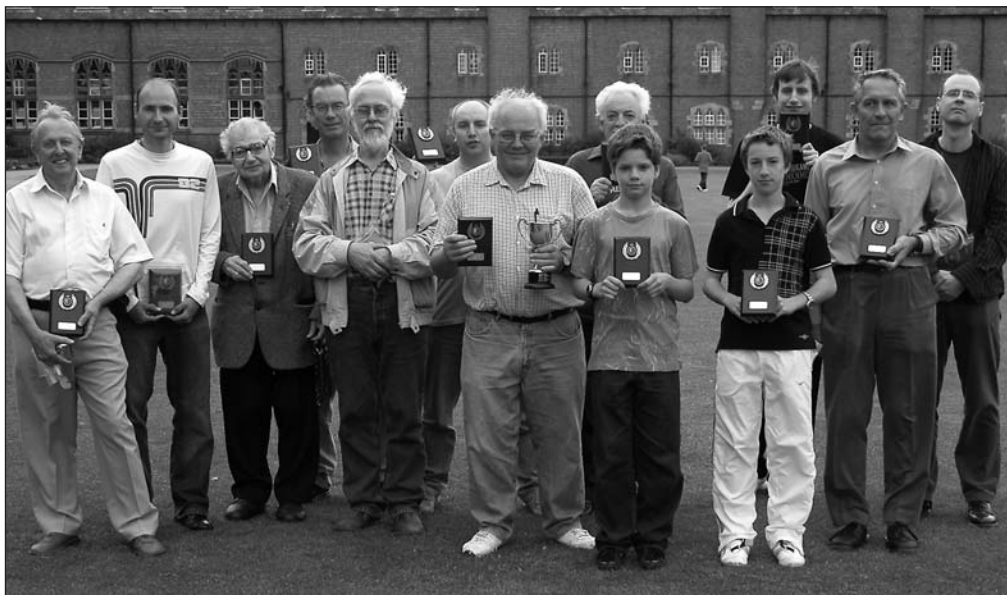
The Essex U100 Team