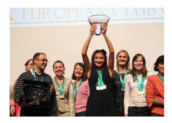
The Champions from AVS