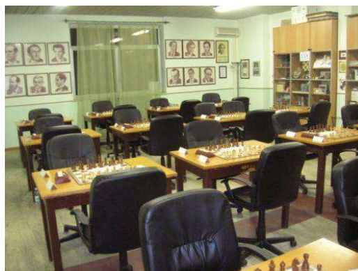
Edoardo Crespi Memorial playing venue

The 32 nd Crespi Memorial was held on December 03-11, 2011 in Milan, Italy.