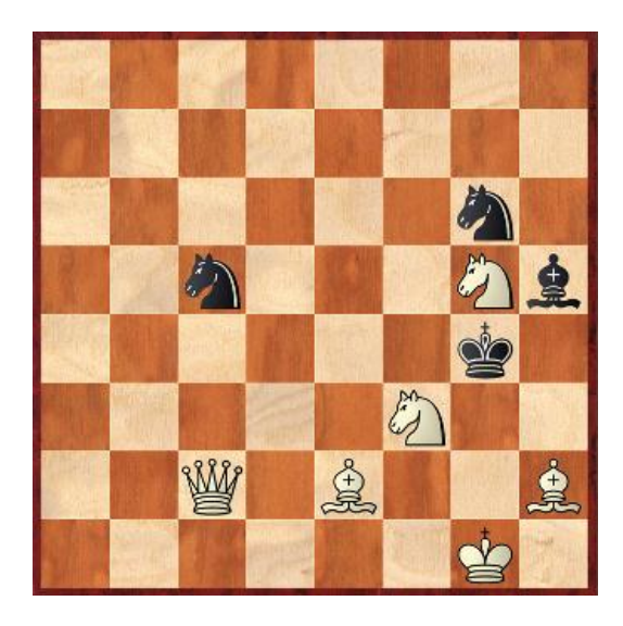
Problem No.1 Mate in 2