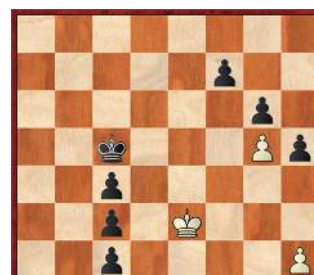
White to play and win

(Diagram left) Three pawns are rarely a match for rook and knight (unless they are all lined up one move from promotion) but a player in the Challengers with not much time on his clock found them too hot to handle in the following tragi-comedy. 51.Nc2? 51.Na6+ and 51.Nd3 are both better choices to secure the win. The text wins but only if White follows up with a beautiful study-like move that few (if any) humans would have been capable of