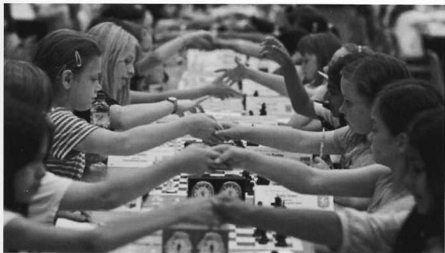
A handshake starts the game