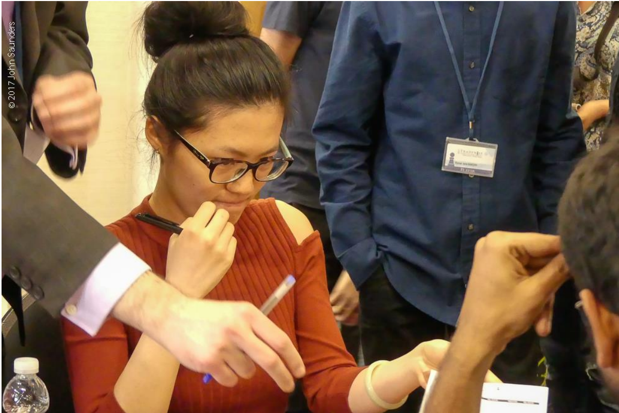
Hou Yifan signs the scoresheets after her five-move protest game

I write "vague" since, despite a subsequent video interview made an hour or two later, it's still not entirely clear why she should have resorted to such drastic action. She has made no specific allegation about the pairings other than to say that she was "upset" by them, perhaps because she was paired with seven female players in the course of the tournament. Few people in the world at large (apart from a handful of internet trolls) thinks this is too big of a deal, and the pairings have since been checked and found to be correct by a number of reputable independent officials watching from afar. Hou Yifan has since apologised to chess fans but so far she has failed to do so to the tournament organisers.