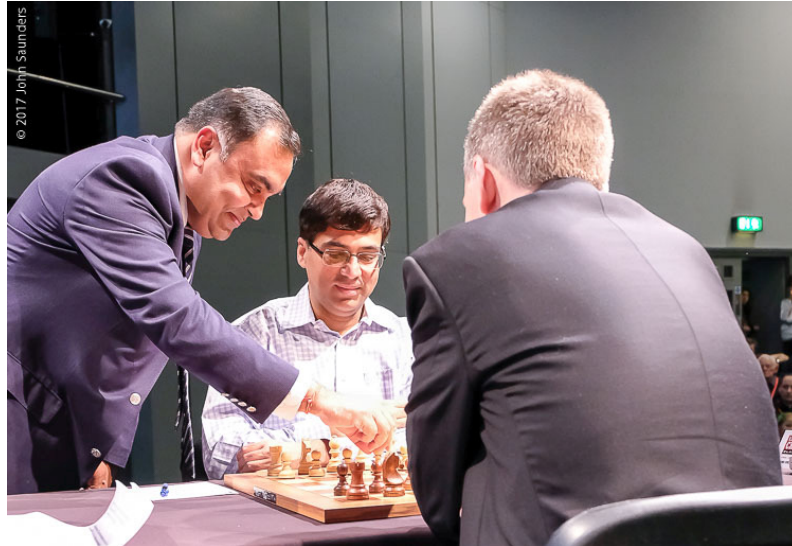
World champions enjoy the privilege of having their country's High Commissioner to move the pieces for them

exchanged, the pawn structures remained balanced and the game moved serenely to its close. Nothing to see here, move along now.