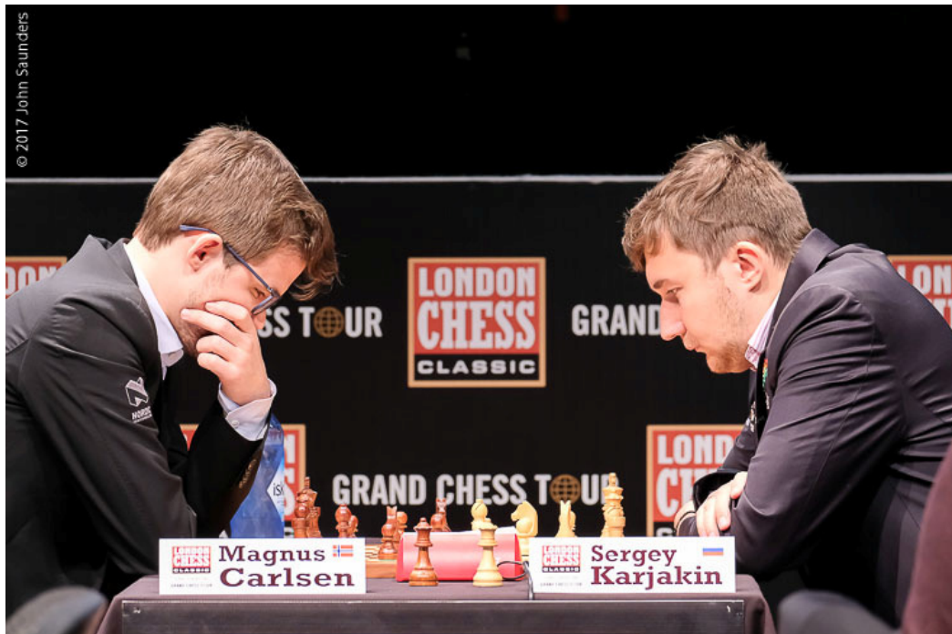
"We meet again, Mr Karjakin!" The 2016 world championship opponents renew their rivalry.