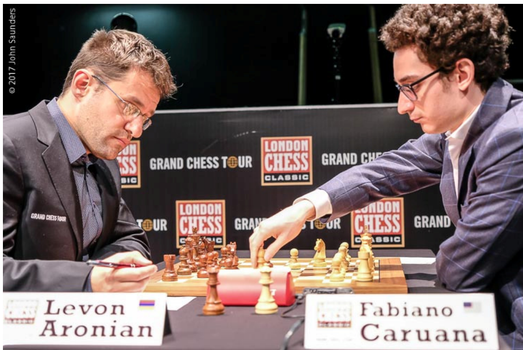
Levon Aronian has got two Blacks out of the way in the first two rounds

staring across the board at their opponent's coat of many sponsors' colours. I'll confine myself to one second-hand comment: super-GM emeritus Jon Speelman, watching from the VIP Room, thought 21.f4 might have given White a little something. He was speaking without benefit of silicon, as he always does, but the engines agreed with him. The idea was to open up the e-file for White's rooks. It's still unlikely to have done too much damage to the Carlsen camp but it was a tad more enterprising than the line Karjakin played. Carlsen's comments at the end suggested he was toying with the idea of a grind but he decided it wasn't worth it and bailed out.