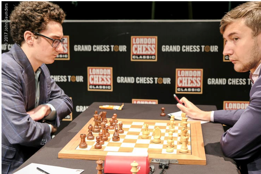
Fabiano Caruana out-prepped Sergey Karjakin in the day’s key game

Classic, you might adjudge this a case of the pot calling the kettle black. I, of course, could not comment. Anyway, a little while later Fabiano Caruana took it upon himself to reply: “we’re thinking of renaming it to the Anish Giri Cup” . I’m not sure Fabiano was the originator of this joke, which had been retailed round Olympia by word of mouth for a while before Fabiano posted it, but I’m not going to reveal the name of the person whom I think did dream it up. Anish came back: “Leave jokes to me, stay focused there brother. Tomorrow another black. Be solid. Stay true to yourself. Repeat your files. We don’t want any accidents.” Fabiano’s move: “True! Wouldn’t want an accident like against Van Foreest.” That’s a cheeky reference to a game from the recent Dutch Rapidplay Championship in which Anish was (as we say in London) done up like a kipper by 18-year-old GM Jordan van Foreest. Anish: “Below the belt” , and the banter continued awhile.