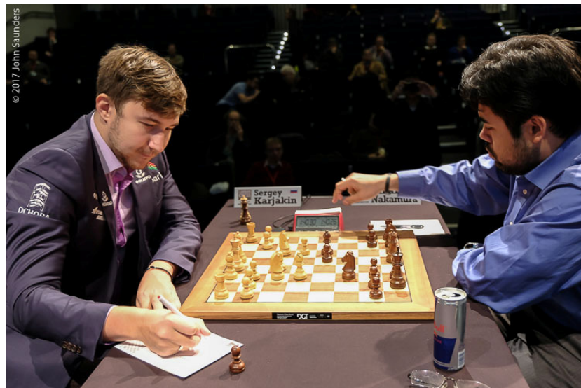
Sergey Karjakin pressed Hikaru Nakamura but the US player made his ninth draw out of nine

29.Qd4 c5! 30.Qd1 30.Nf5? loses to 30...Ng3+! 31.fxg3 Qe2+ and mates; 30.Nd5 and again 30...Ng3+! is lethal 30...Qf6 30...Qh4 is still stronger: 31.g3 Qxh3+ 32.Kg1 Nc3! is the end. But the text is also very strong and demands accuracy from White. 31.Ng4 31.Qd7, threatening Qe8+ and Qxe4, keeps up a fighting defence but the text quickly succumbs. 31...Qc3 32.Nce3 h5 33.Nh2 Qb2 0-1 To prevent mate, White must lose at least a second pawn.