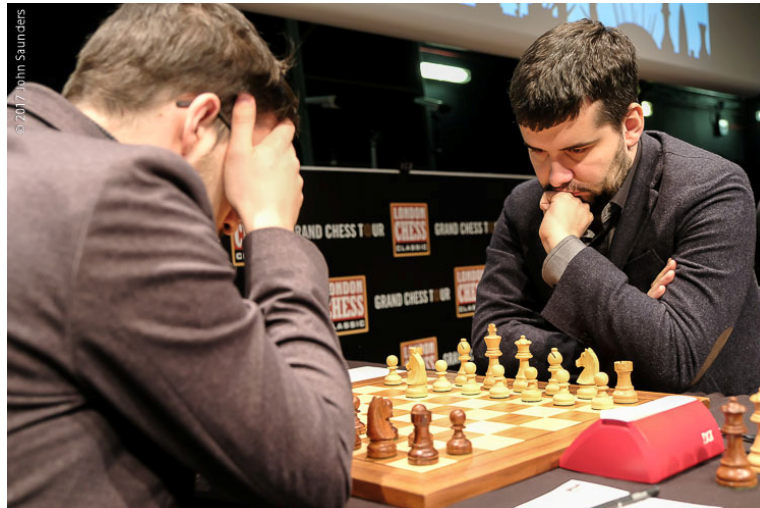
Nepomniachtchi and Vachier-Lagrave: almost as many letters in their surnames as moves in their game

an element of interest when Nepo played 9.Ndb5 followed by a pawn sacrifice. It was probably all planned in advance by White as it occurred in a pet line of MVL's. The basis of the plan was to open up the d-file against the black queen, and also exploit a pin on a knight, and it was hard to see how Black was expected to continue without running the risk of having a much worse position.