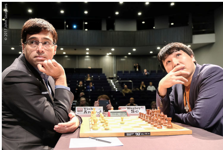
Vishy Anand's birthday coincided with Wesley So's return to form

Round nine coincided with Vishy Anand's 48th birthday but it proved an unlucky one at the chessboard. Perhaps a birthday becomes something of a burden to an active