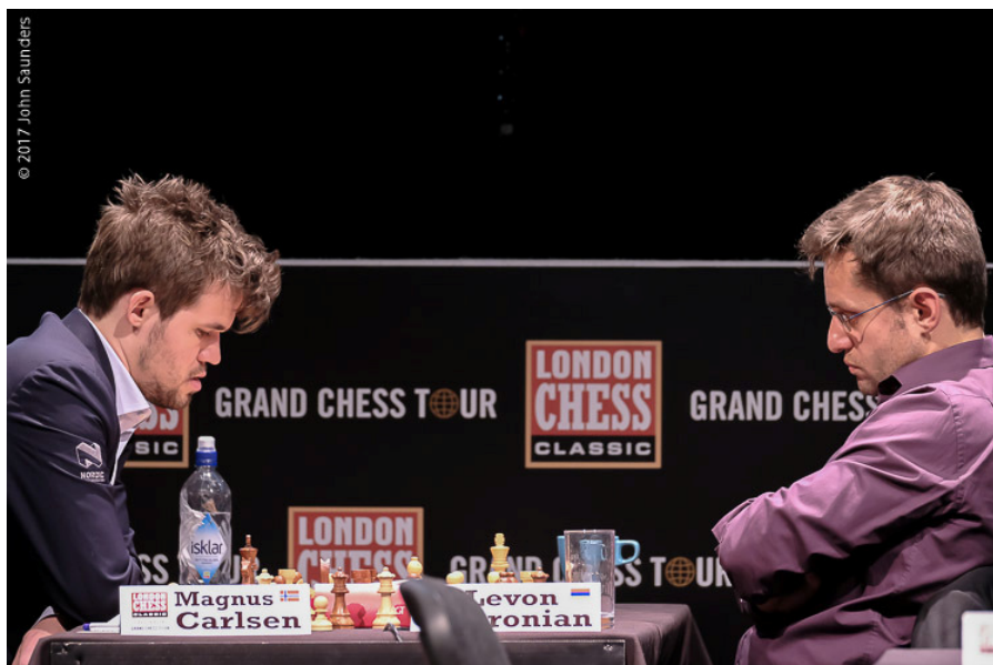
Carlsen was back to his resourceful best against Aronian

In fact, Nepo had to wait another 5+ hours to see whether he would have to play a tie-breaker as Caruana-Adams went the distance. It was, as soccer commentators like to say, “a game of two halves”. An imbalanced middlegame seemed to favour Adams around move 30-33, with Caruana admitting later that he had been prepared to repeat position in lieu of anything better to do. But some inaccuracies from the Englishman (Adams himself thought 33...Ra5 could have been a key mistake) saw his position disintegrate markedly and by the time control it had resolved itself into a queen and rook endgame with Caruana having an extra pawn. Mickey may have been able to do better in the endgame but in practice the defence was tough and Fabi relentless. Beating Mickey Adams is never easy and this was a fine way for the US player to conclude his tournament. England’s number one said of his own performance, “I gave away too many early Christmas presents.”