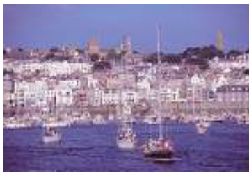
Guernsey is full of visitor attractions and places of historical interest