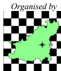
Organised by The Guernsey Chess Federation