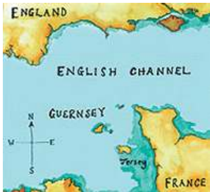
Location in English Channel