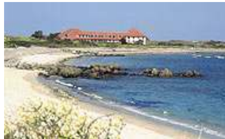
Venue hotel on Guernsey's sandy west coast