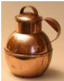
Traditional milk can