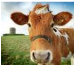
Guernsey cow and Martello tower in the background