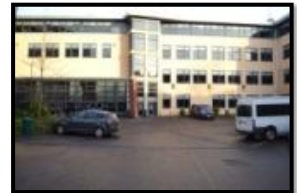
St Thomas of Aquins School, Back Entrance.