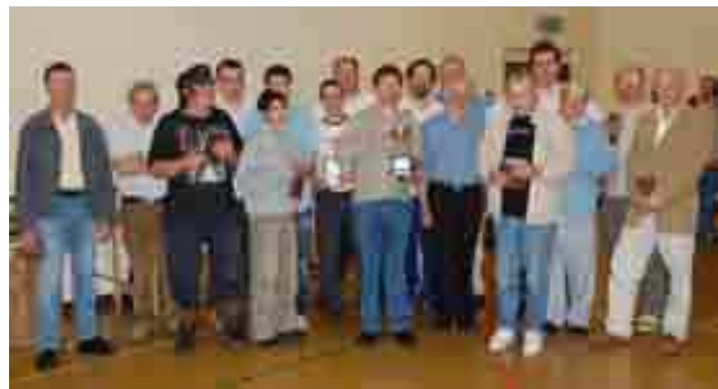
Norfolk U125 Team