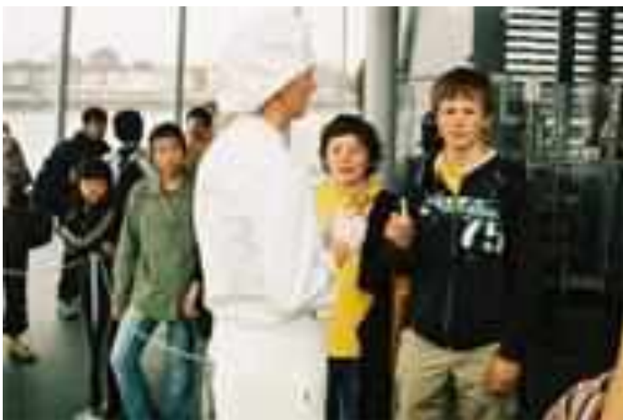
Photo: The Chocolate Tasting

In addition to the chess, the social programme involved a day at Phantasialand, where 6.5 hours of solid riding was the general aim and every ride in the park was sampled by most of the players (but none of the leaders!). We also visited the cathedral and a chocolate museum, where we saw how it was made, sampled it and bought plenty of it. All in all, it was another good trip enjoyed by players and leaders alike.