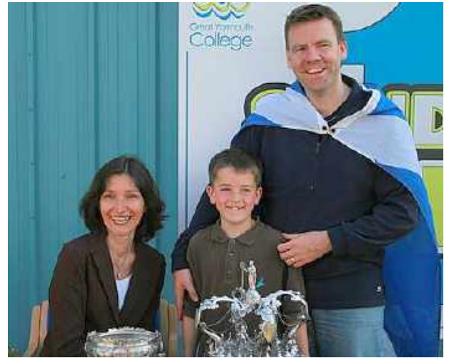
Happy Champions with adopted mascot