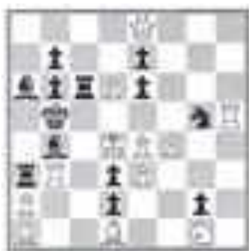
Reflexmate in 2

Both kings have some freedom here, and the thematic play is based on this fact. White's key-move is 1.Qd7 , which waits for Black to commit himself. If 1...Rxa2 , 2.Kxd3 is played, and now Black must give a reflexmate with 2...Kc5# . 1...Ra5 allows 2.Ke5 , when 2...Kc4# is mate. 1...Ra4 leads to 2.Rxd3 , and 2...Bc3# must give mate. 1...Rxb3 is answered by 2.e5 Bc5# , 1...Ka4 by 2.Ne2 Nf3# , and 1...Ka5 by 2.Rb2 Bc3# . Two further variations round off a very rich problem: 1...e5+ 2.Kxd3 Ka4/Ka5# , and 1...exd6 2.Rxd3 Bc5# . Clearly the interaction of pieces in this problem is nothing like what you will encounter in over-the-board play. That is what gives chess problems much of their charm and their appeal: they reveal to the full the potential of the chess pieces, a potential that is seldom realised in the cut-and-thrust of actual play. Visit the British Chess Problem Society's website ( www.theproblemist.org ) and find out more!