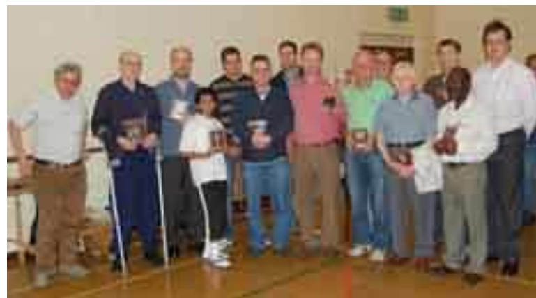
Shropshire U100 Team