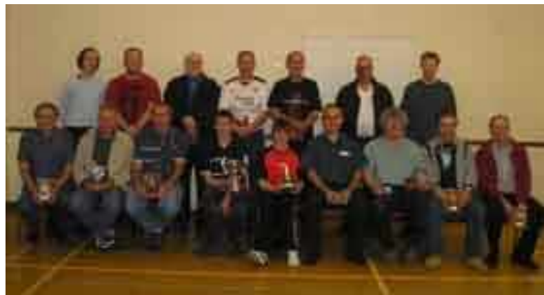
Lancashire U150 Team