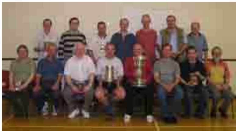
Lancashire Open Team