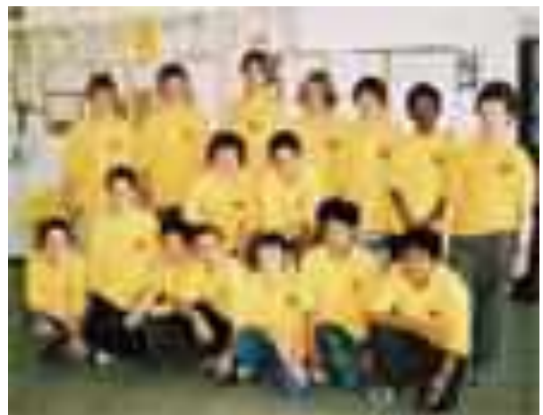
Photo: The group in Porz-Wahn