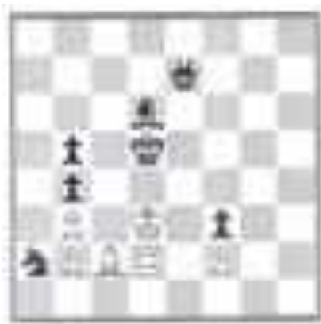
Helpmate in 3: 2 solutions

This problem, recently honoured in a composing tourney in The Problemist , is a helpmate: Black plays first and co-operates with White to reach a position where White can mate in one. Black's moves are shown first in the solutions of a helpmate. There are two ways of solving this one, with an attractive correspondence between the solutions. Both feature two moves by the white king and one by the black king, but before these can be played Black must arrange his bishop and queen so as to block potential flight-squares for his K (this is very typical of helpmates), and the white rook or bishop must take a step down to the first rank. One solution runs: 1.Be5 Rd1 2.Qc5 Kd2 3.Kd4 Ke1# . The second is precisely analogous: 1.Bf4 Bb1 2.Qe5 Kc2+ 3.Ke4 Kd1# . The tourney judge commented favourably on the fact that the square-blocks by Black are carried out by the same two pieces. This makes not only for great unity but also for economy of force, something that is desirable in any chess problem.