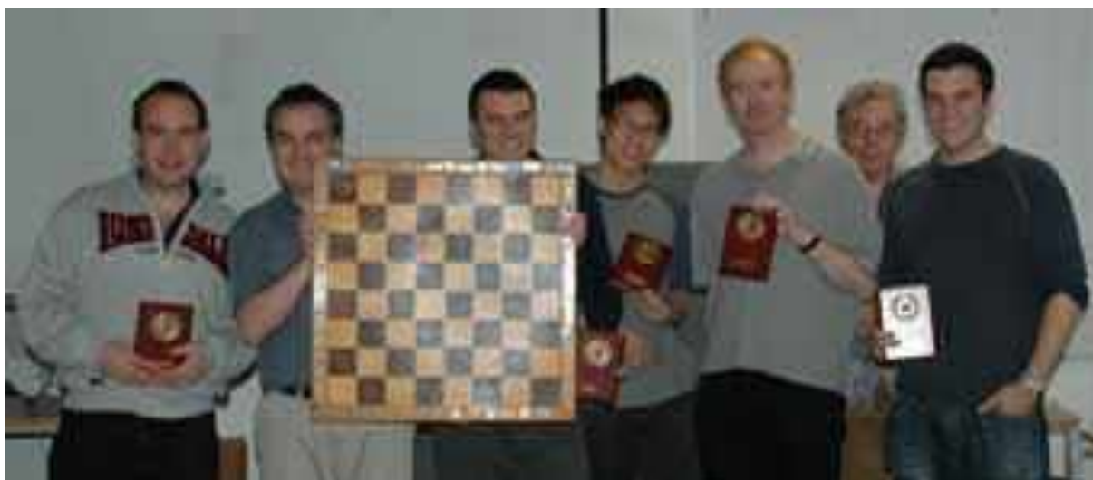
Photo: National Club Open Team