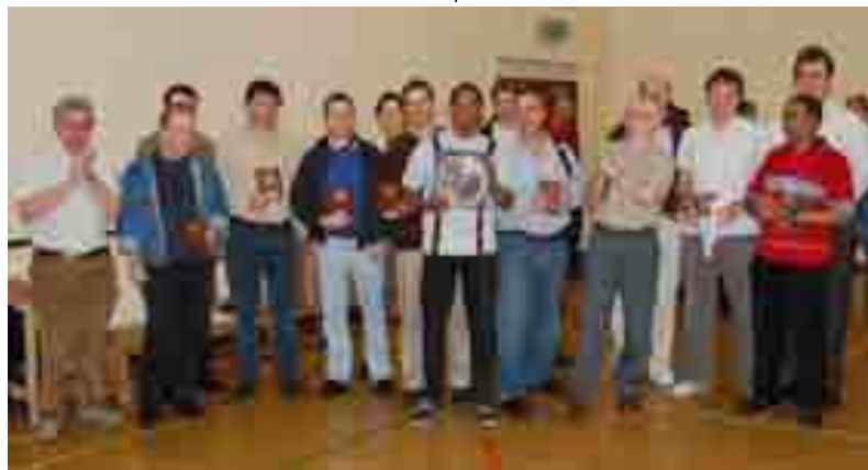
Middlesex U175 Team