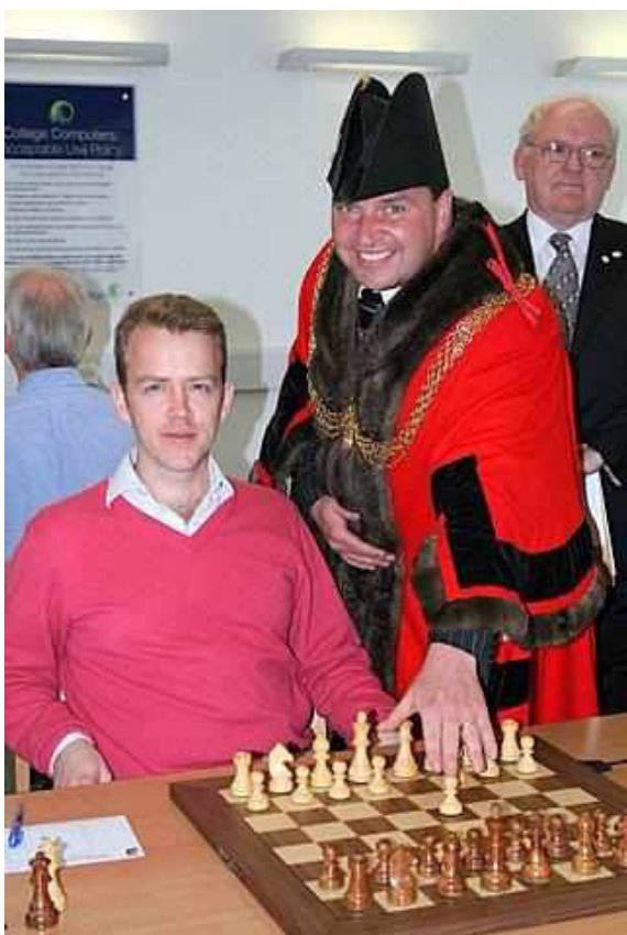
The Mayor starts things off