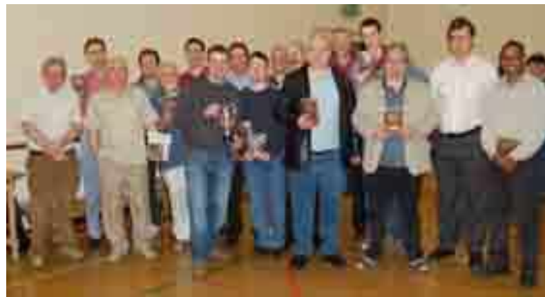
Bedfordshire Minor Counties Team