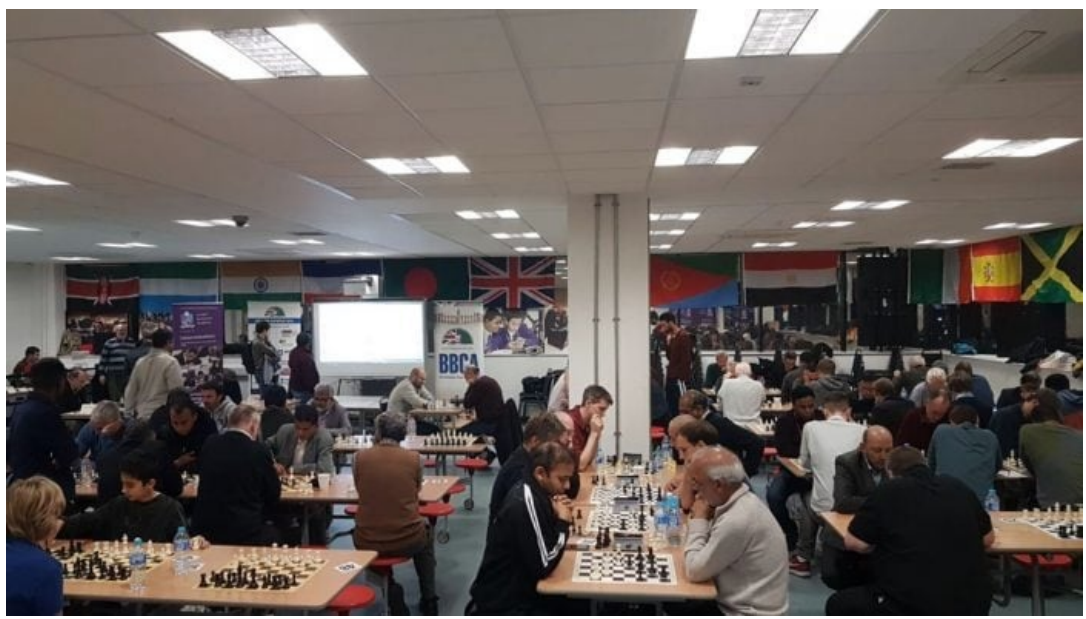
Players at the BBCA FIDE Rapidplay