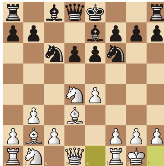
Sicilian Defense: French Variation, Westerinen Attack